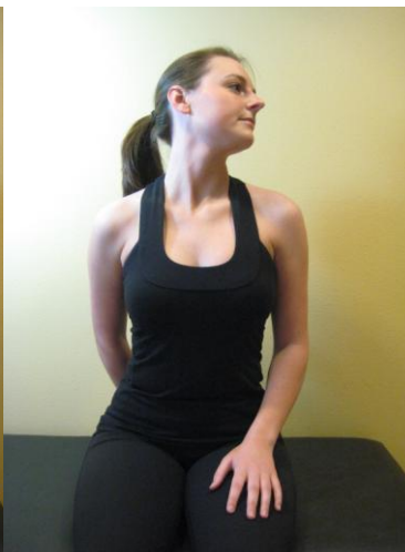
2. Anterior Scalene