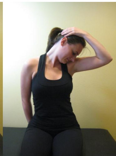
3. Posterior Scalene

Medical Dental Building 509 Olive Way, Suite #620 Seattle, WA 98101